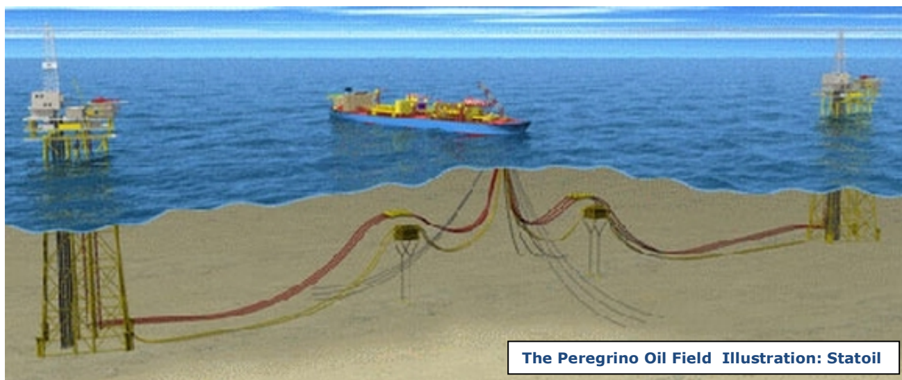
The Peregrino Oil Field Illustration: Statoil

Venue: Auditorium, Måltidets Hus, Ipark, Ullandhaug